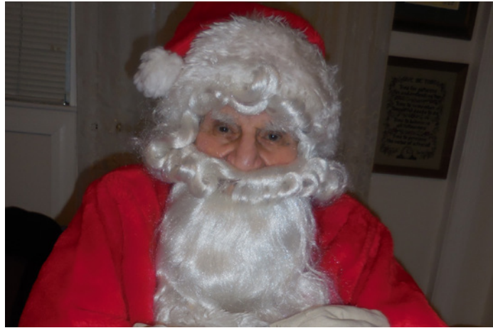
Jolly Old Saint 'Esposito' showing his holiday spirit