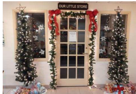
Our Little Store decor brought holiday cheer.