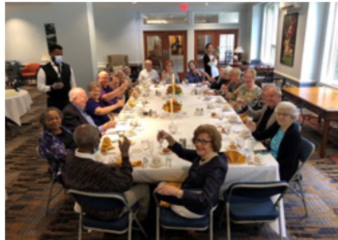
Residents enjoying a delightful lunch to celebrate birthday's during the month of October