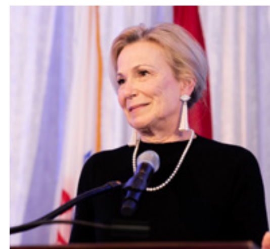
DR. DEBORAH BIRX MEMBER, WHITE HOUSE CORONAVIRUS TASK FORCE

"It's truly an honor to be recognized for the hard work the entire task force put in on behalf of our country's public health response to the COVID-19 pandemic. The 2021 Dwight D. and Mamie Eisenhower Distinguished Citizen Award is especially meaningful to me because ADF and Knollwood serve those I've had the pleasure of honorably serving alongside."