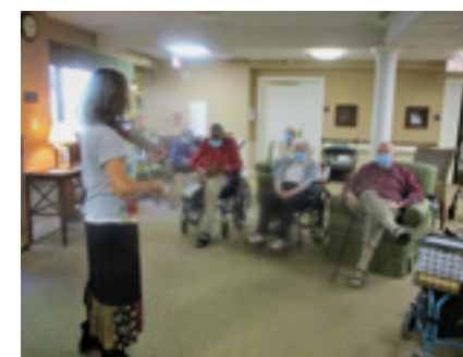
SCC residents enjoyed a delightful violin concert