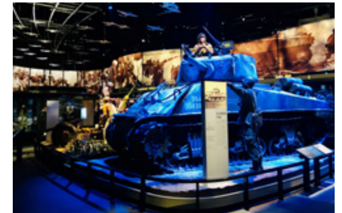
An authentic Sherman Tank from the WWII Era