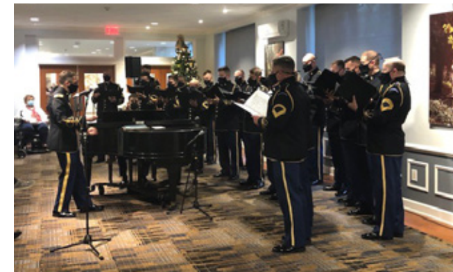
Members of the United States Army Chorus during the concert

After missing last year due to pandemic restrictions, Knollwood hosted the United States Army Chorus for the Hall Holiday Party. They did not disappoint, imparting their special message of Holiday wishes and the Story of Christmas. Even though members of the chorus couldn't stay for shrimp and other goodies, residents enjoyed gathering in the Bistro to enjoy the food and drink, the caroling, and Santa, who popped in for a quick visit.