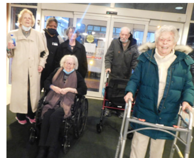
Many happy smiles as residents prepare for a trip

Assisted Living residents had the opportunity for 3 bus outings! The trips included a drive to discover the beautiful fall colors and two outings to experience the beauty that is the Seneca State Park Holiday Lights. Masks were allowed to come down for the quick photo shoot. It is so hard to keep all of those beautiful faces covered, but everyone is giving it their best as we are all trying to look out after one another.