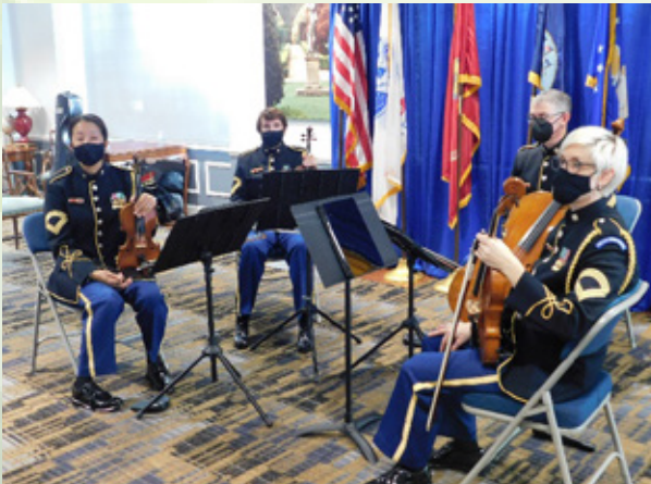
Musicians from the US Army Strings before playing their Veterans Day Concert at Knollwood

Veterans Day is a special time at Knollwood. In November, the Wellness department hosted many wonderful events. From the United States Army Band, a talented group comprising US Army Strings played inspirational and traditional favorites for the residents.