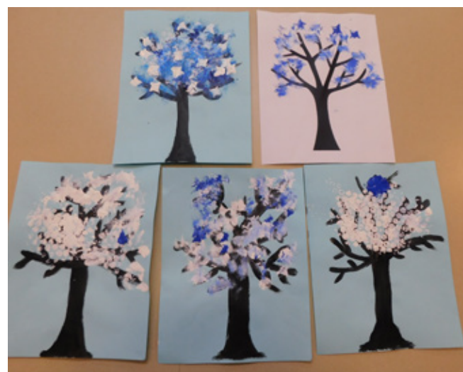
A collection of paintings from all the artists